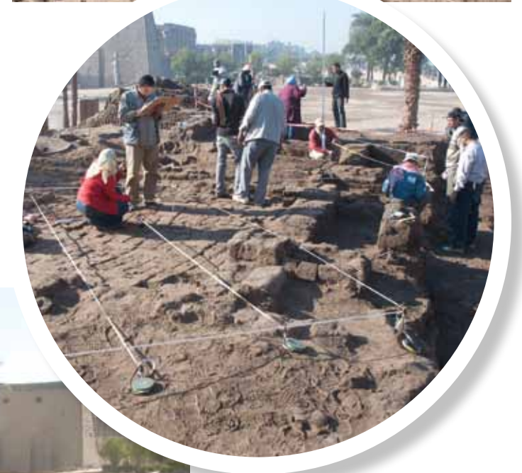
Taking down the mound, from the top clockwise: Mapping the summit of the mound prior to excavation. Clearing the west side of the mound. Mapping the floor of a medieval building. The mound nearly down to ground level with a Roman Building exposed.