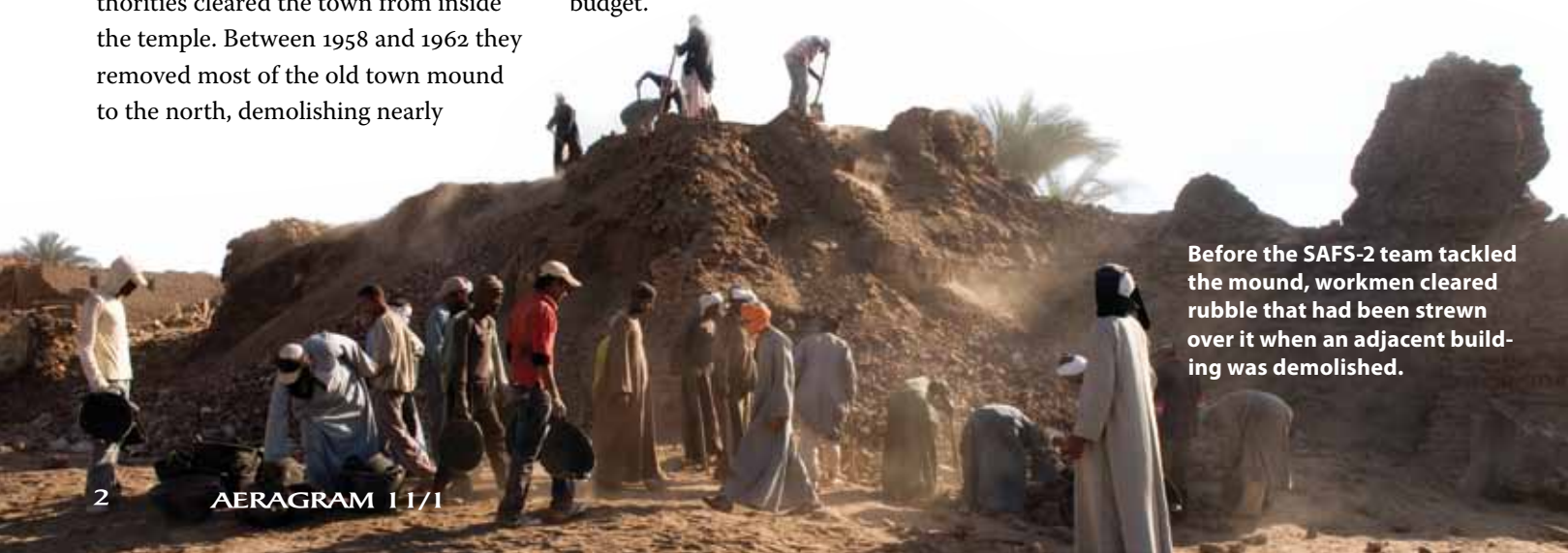
Before the SAFS-2 team tackled the mound, workmen cleared rubble that had been strewn over it when an adjacent building was demolished.