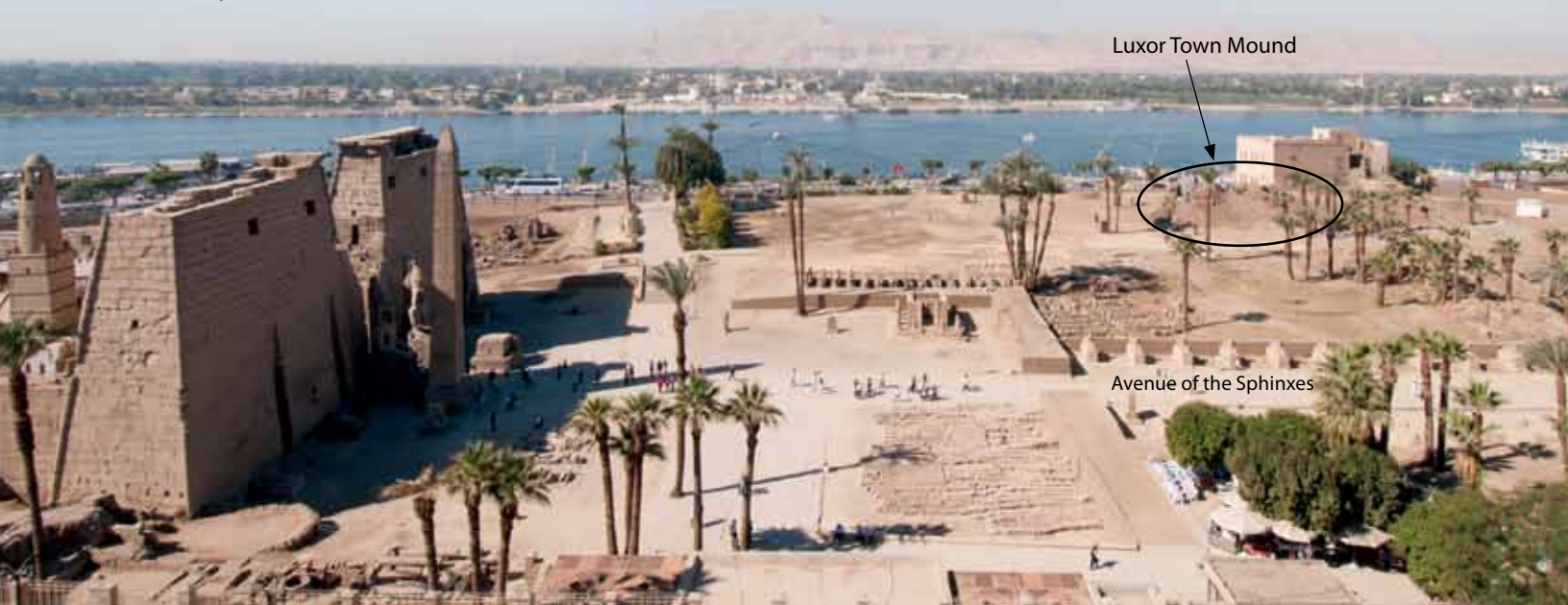
Luxor Temple (left), Avenue of the Sphinxes (right), and the last remnant of the Luxor Town Mound, adjacent to the remaining early 20 th century “palace.” Beyond lie the Nile and the West Bank.

*Tôd, a site in the Luxor area, furnished material from the Ptolemaic up to the Early Islamic Period. However, these ceramics came from contexts that were not well stratified.