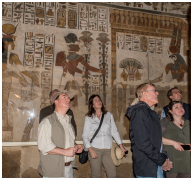
Former Congressman and ARCE President's Advisor Council member, Ed Royce along with Deputy Chief of Mission at US Embassy in Cairo, Dorothy Shea touring Khonsu Temple