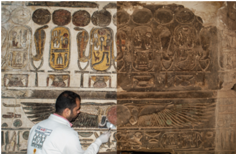
Conservation trainee cleaning blackened wall at Khonsu Temple

Strengthening Egyptian-American relations through scholarly research, preservation, and conservation